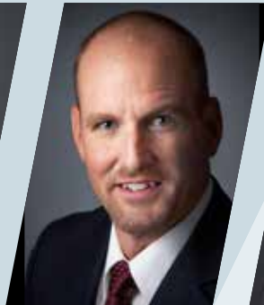
BEAR PRAIRIE City of Idaho Falls, ID