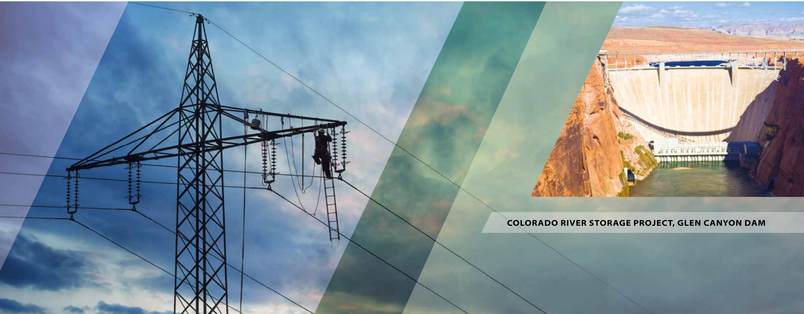
COLORADO RIVER STORAGE PROJECT, GLEN CANYON DAM