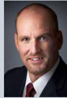
BEAR PRAIRIE City of Idaho Falls, ID