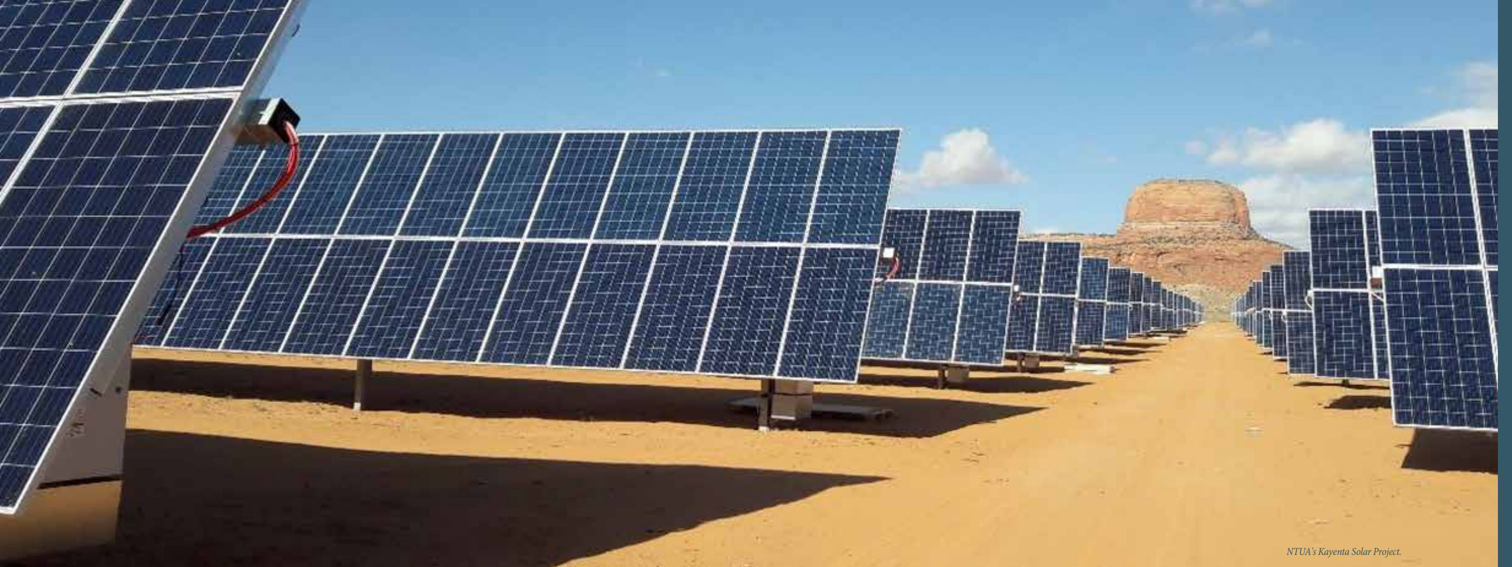
NTUA's Kayenta Solar Project.