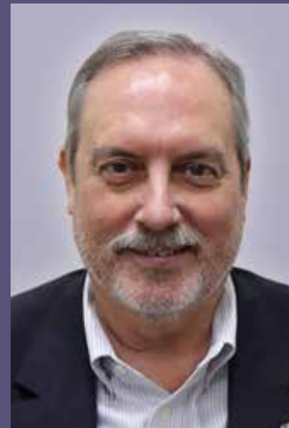
Mayor Holly Daines , City of Logan, UT