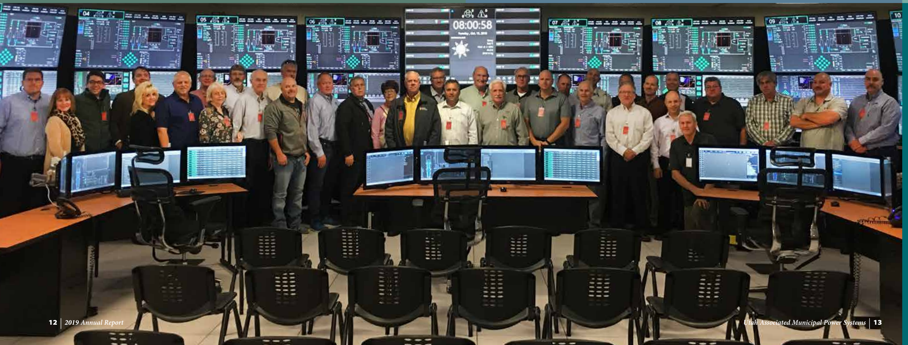
UAMPS board and staff tour the NuScale Simulator in Corvallis, Oregon.