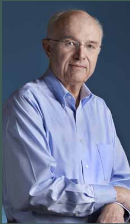
Dwight Day Hunter Project, Power Pool Project

In the late 1970s, many Utah municipal power utilities recognized the need to have their own power supplies. Demand was growing and the Colorado River Storage Project (CRSP) power was limited. A major problem occurred, when the Utah Public Service Commission (PSC) prevented Utah Power & Light (UP&L) from selling wholesale power to municipals but, at the same time, required UP&L to give municipal utilities the opportunity to buy a portion of its Hunter II power plant.