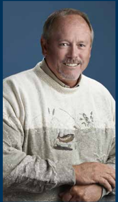
Jack Taylor Craig-Mona Transmission Project, Central-St. George Transmission Project

It's not enough to generate sufficient electricity. Just as important is the ability to move the power where it is needed.