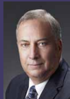
VON MELLOR PAROWAN CITY